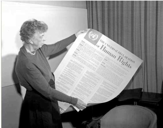
Eleanor Roosevelt with the Universal Declaration of Human Rights.

This declaration was the first international declaration of the human rights and fundamental freedoms to which all human beings are intrinsically entitled. It was initially adopted in 1948.